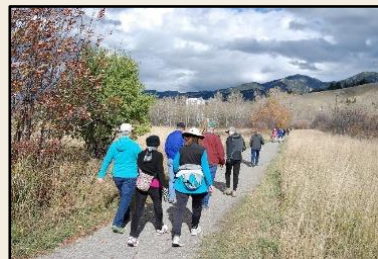
CROP Walkers hit the trail