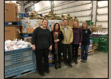
Volunteers pose with Thanksgiving bags

for their ongoing commitment to GVFB and to serving their neighbors with such compassion. Happy Thanksgiving to you all!